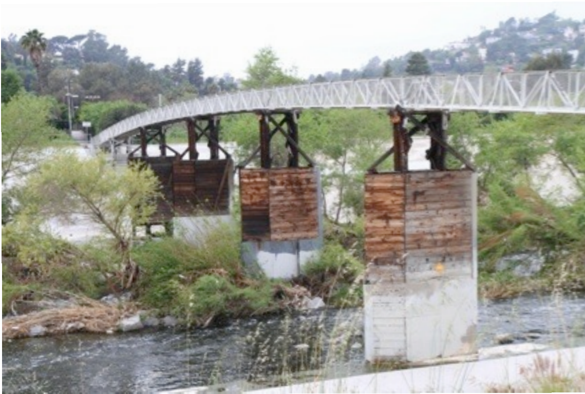
Sunnynook Bridge, photo by Scott Pitts, ScottieImages.com